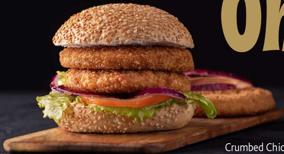
Crumbed Chicken Panko Burgers

Grain Field Chickens has launched a range of juicy, delicious crumbed products that are quick and easy to prepare.