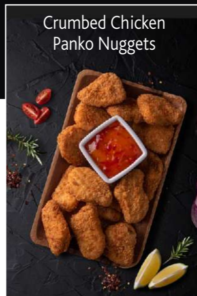
Crumbed Chicken Panko Nuggets