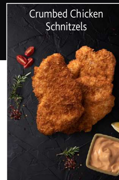
Crumbed Chicken Schnitzels

The new Grain Field Chickens product range offers a quick and easy substitution for restaurant and take away meals – easy cooking for snacking, lunch and dinner. These products will be merchandised in the freezer alongside other frozen products.