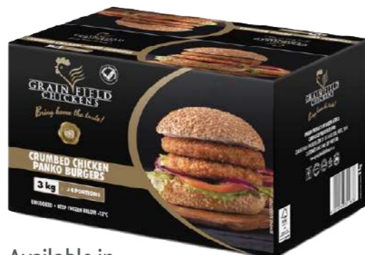
Available in 1 kg bags or 3 kg packs

Grain Field Chickens products and service quality are non-negotiable.