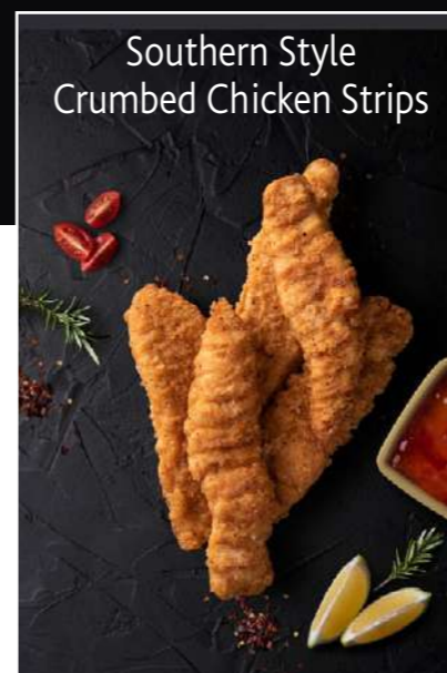
Southern Style Crumbed Chicken Strips