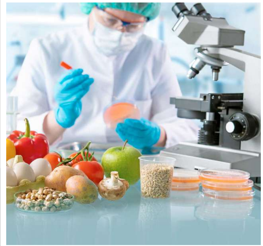
nationaltoday.com_world food safety day

don't do what you have to do today, your doors won't be open tomorrow."