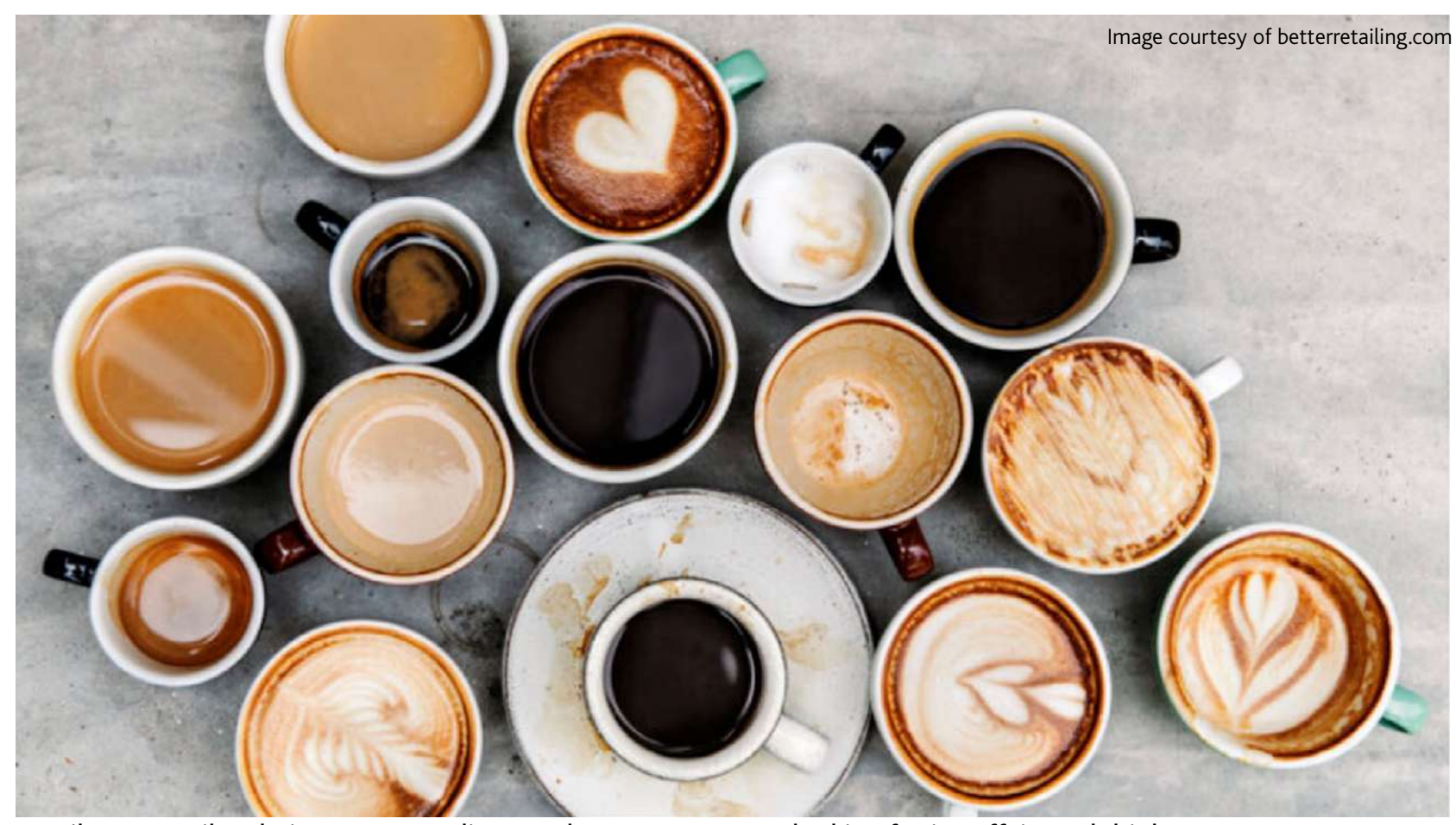
Retailers can tailor their range according to what customers are looking for in caffeinated drinks.

Meanwhile for those who enjoy a more robust brew, and despite the increased price tag, coffee is still king. Even with supply challenges, rising costs, and budget-constrained consumers, coffee consumption remains relatively constant. According to www.ResearchAndMarkets.com, the local coffee