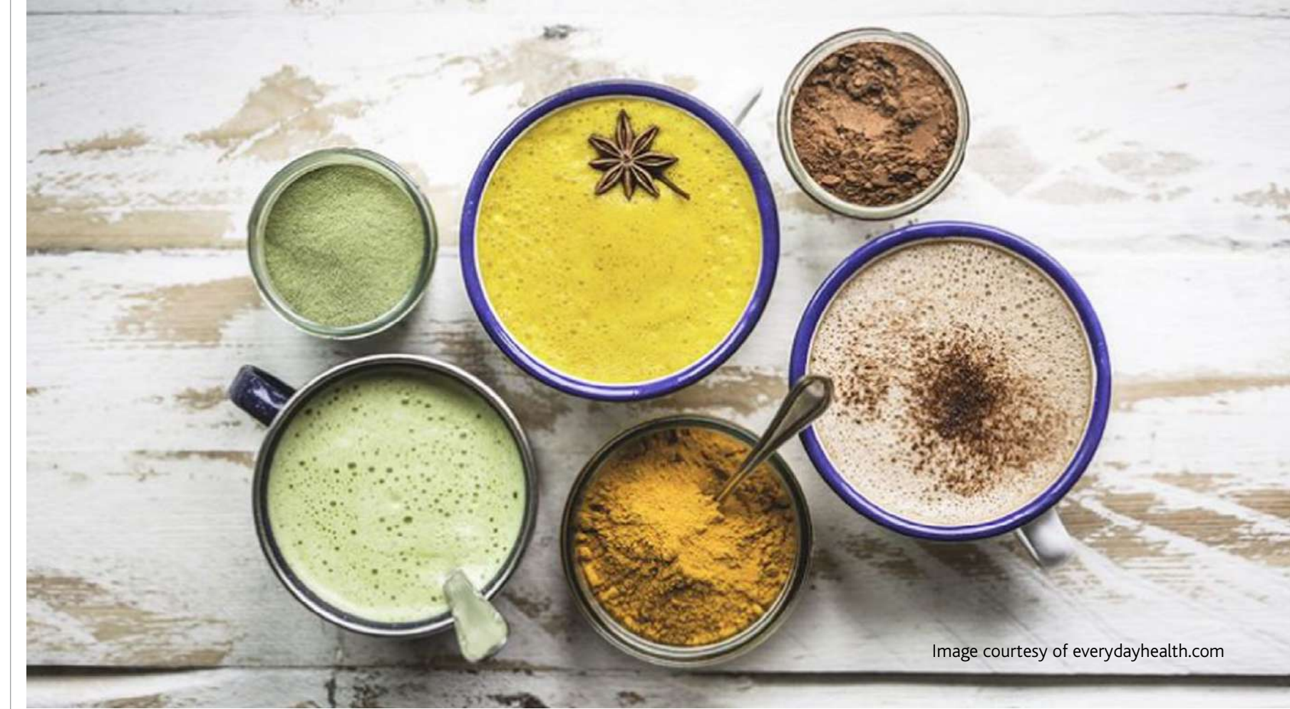
These steamy mugs are more than just comfort in a cup – they provide key nutrients, too.

One thing to remember though is the new labelling laws set to take effect in South Africa. According to these, many health claims made on labels will now be illegal or subject to intense verification processes.