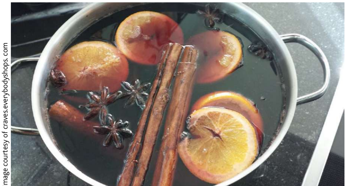
Mulled wine ... On a cold day, spiced wine is a perfect way to warm up. Make your own in a crock pot with bold red wine, spices, fresh fruits and some cognac.

Premiumisation. Mid to upper income consumers are becoming accustomed to a highend, premium experience. This includes top quality instant coffees, pods, beans, and grounds, and can be seen in the tea category as well. Premium instant coffee has seen the biggest growth in this category. Promotional prices are helping to drive this.