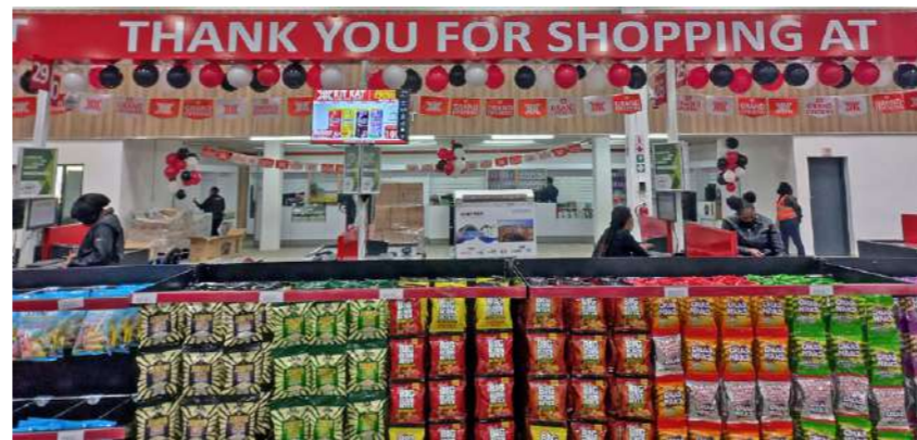
Eye-catching messaging is bold at Kit Kat