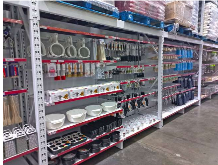
Kitchen items for the aspiring baker