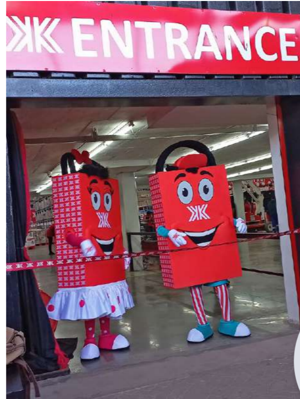
Kit Kat mascots Kiki & Koko

Strict Covid-19 rules and regulations are followed, ensuring customers are safe whilst enjoying the shopping experience. With 69 operating till points, check out is sure to be a breeze.