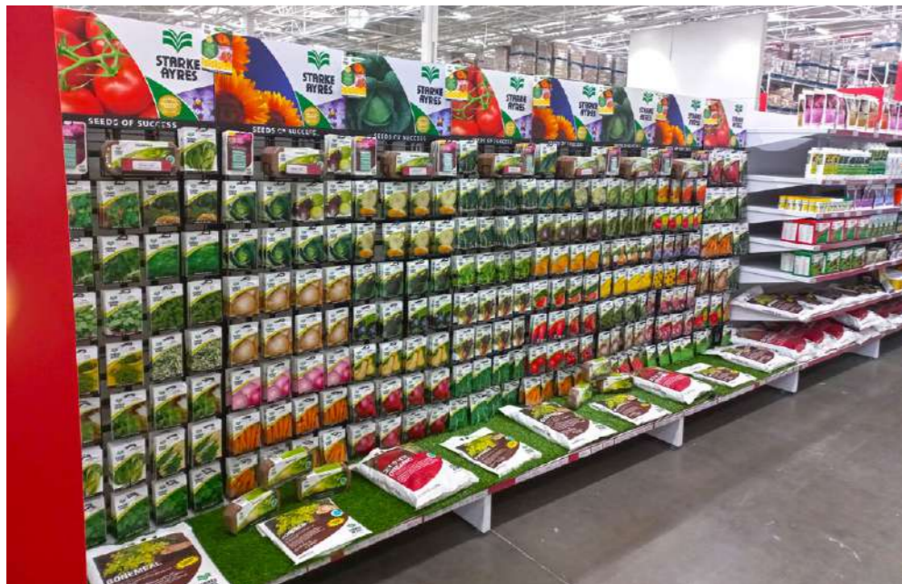
A great range of Stark Ayres products for the budding gardener

The fridges are fully stocked – greatly supported by Clover