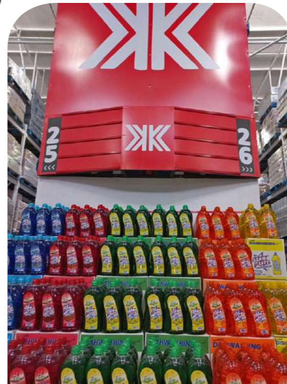
Boldly branded gondola end stacked with dishwashing liquids