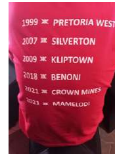
The back of the employees' T-shirts show the timeline of store branch openings

At the exciting grand opening, the Kit Kat brand was front and foremost