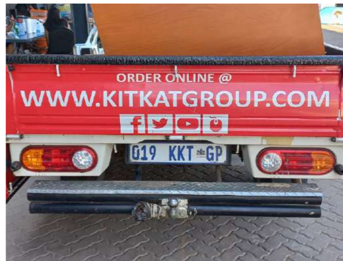
Delivery vehicle ready to bring your orders to your door