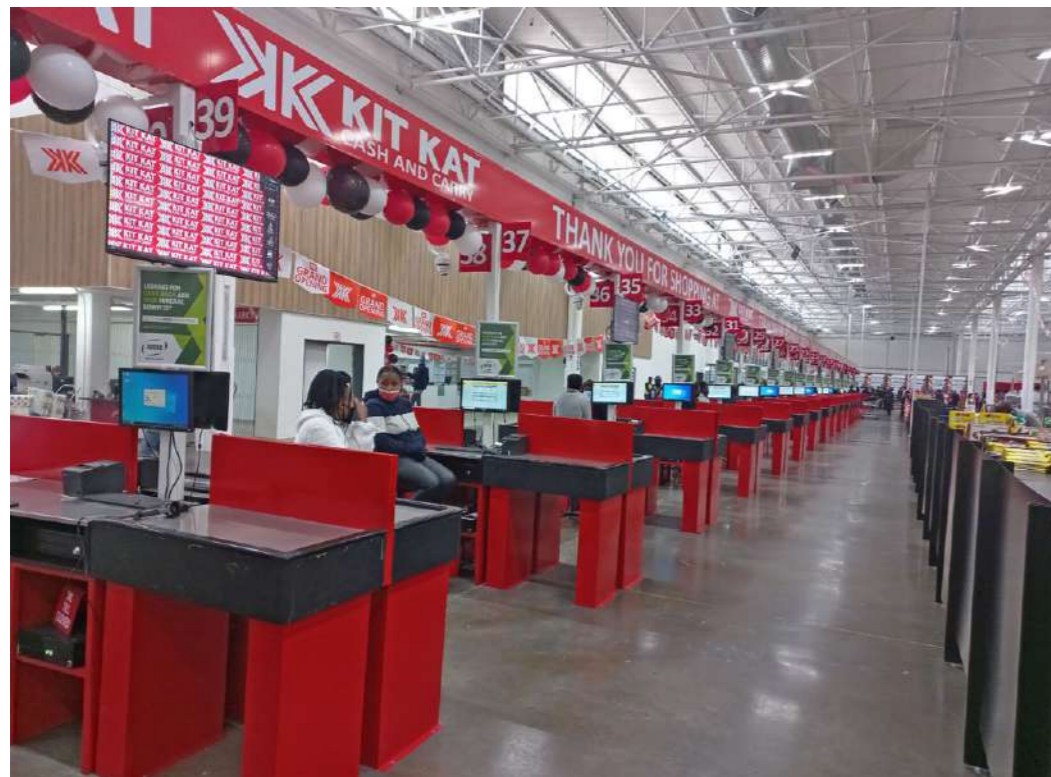
69 till checkout counters keep traffic flowing