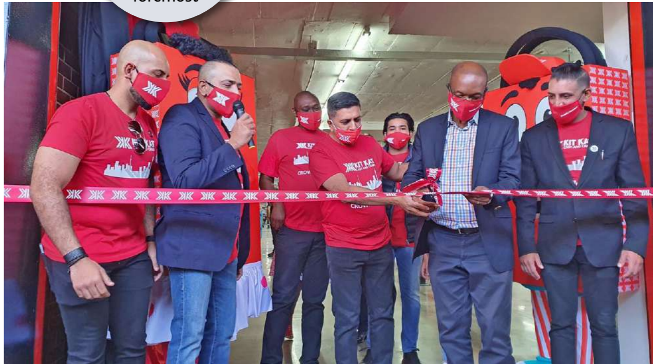
A team of Kit Kat buyers