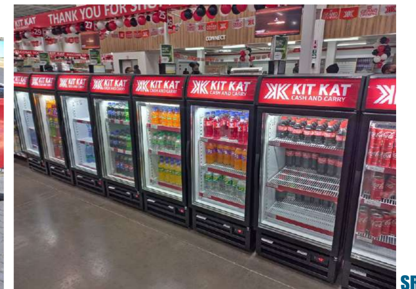
Refreshments to keep you hydrated during your shop