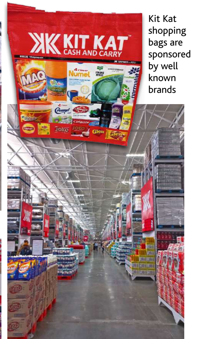
Kit Kat shopping bags are sponsored by well known brands