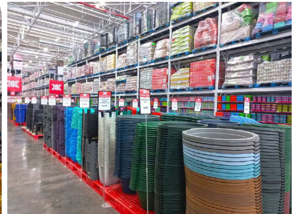
Plastic goods stocked to the roof